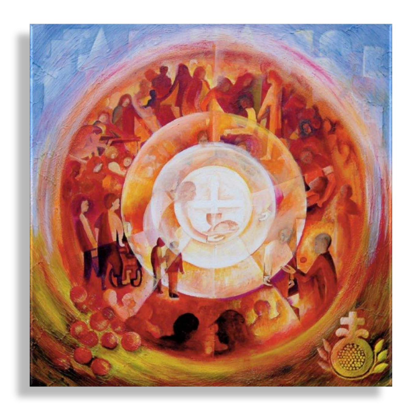
Hospitaller Order of St John of God General Commission of Pastoral Care Rome 2012